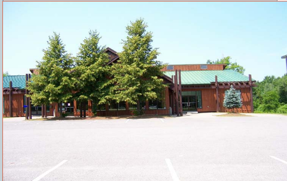
NALMA – Headquarters (lease three office spaces from First Nation) Curve Lake First Nation, ON