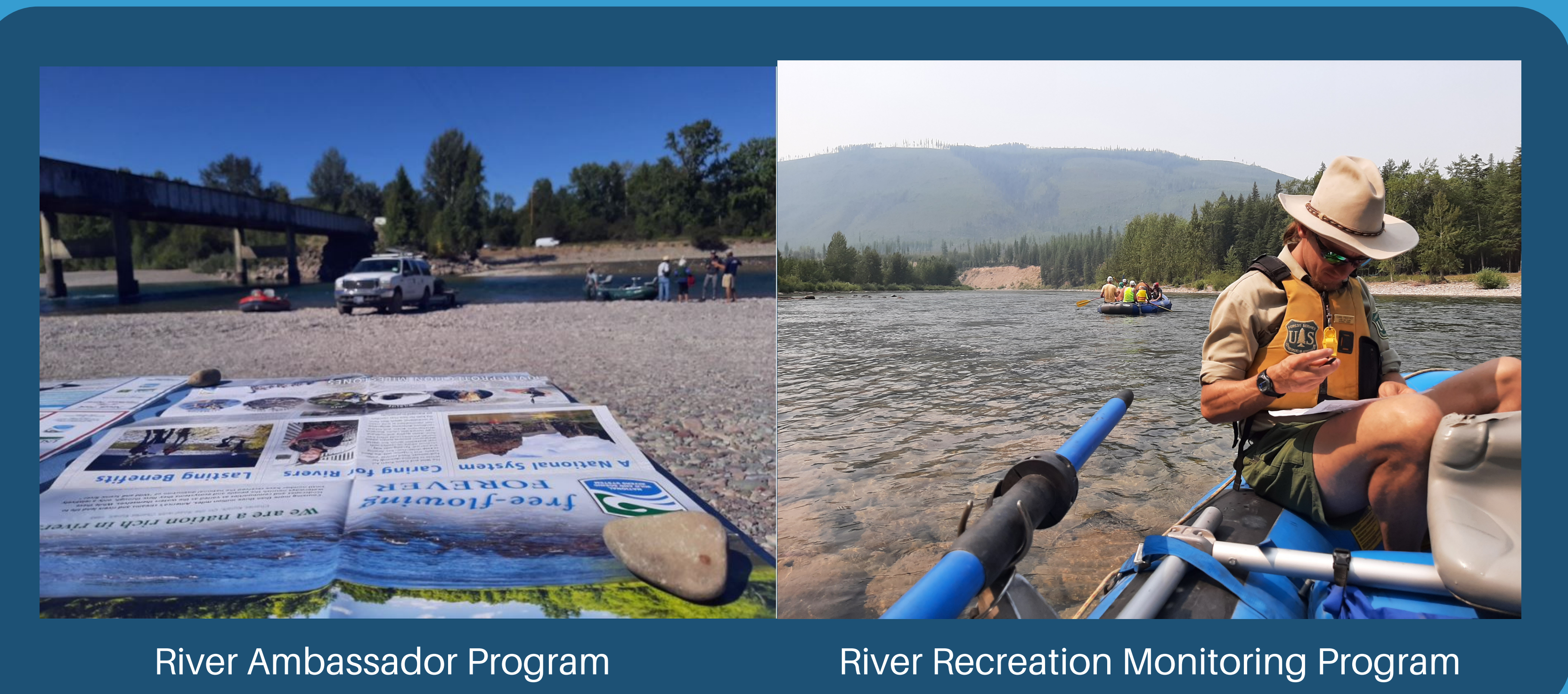
River Ambassador Program