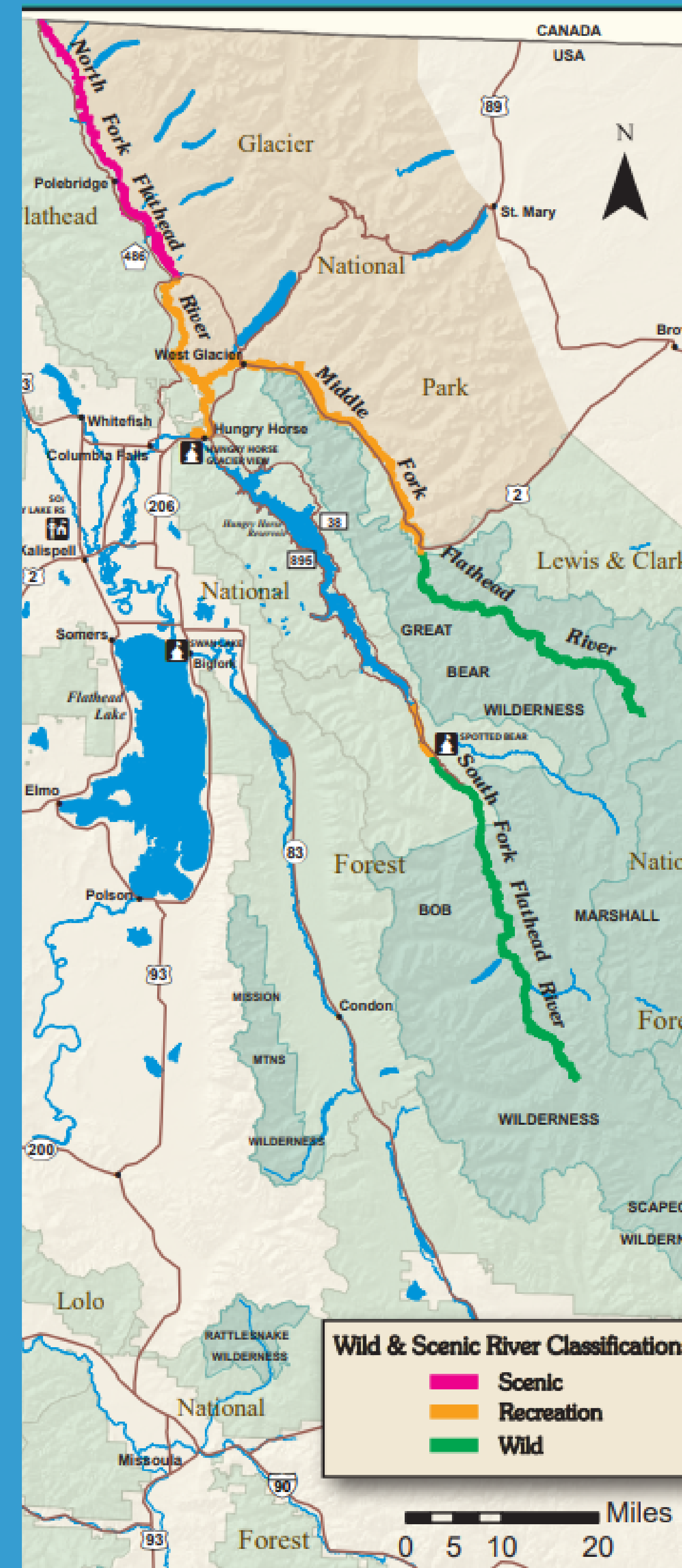
Three Forks of the Flathead River Float Guide, Flathead National Forest, 2018